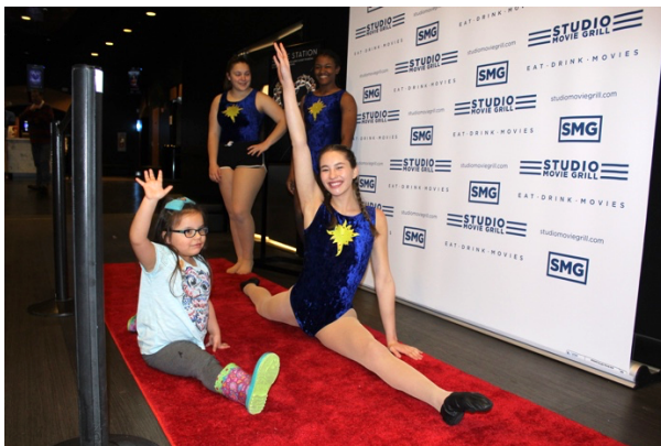
Redlands YMCA acrobat takes to the red carpet with a young moviegoer to show off their skills.

To top it all off, guests took advantage of the daily chance to win free movie tickets for a year, valued at $1,100 and made sure to grab free SMG-branded merchandise as a keepsake.