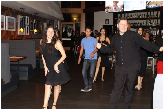
In honor of romance and the movie "What Men Want," dancers from the Fox Theater Redlands boogie to the "Cupid Shuffle" with guests.

Kiddos who came to see "The Lego Movie 2: The Second Part" were thrilled to see a Lego Creative Build activity where they got to create masterpieces of their own before and after the show.