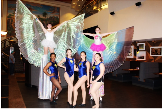
Acrobats from the Redlands YMCA wow moviegoers with their tricks and twirls.