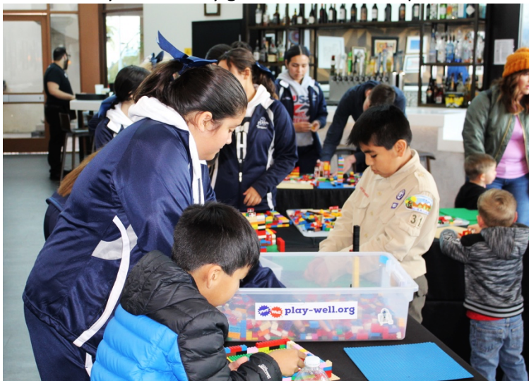
Redlands High School cheerleaders join in the fun as kids participate in the Lego Creative Build.

Kiddos who came to see "The Lego Movie 2: The Second Part" were thrilled to see a Lego Creative Build activity where they got to create masterpieces of their own before and after the show.