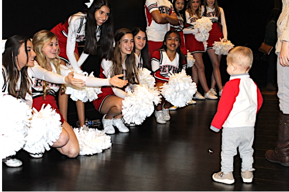
Cheerleaders from Redlands East Valley High School greet a young moviegoer.

Cheerleaders from Redlands East Valley High School and Redlands High School pumped up the crowd, while dancers from the Fox Studio Redlands turned the dining area into a dance floor providing live entertainment and even a few lessons.